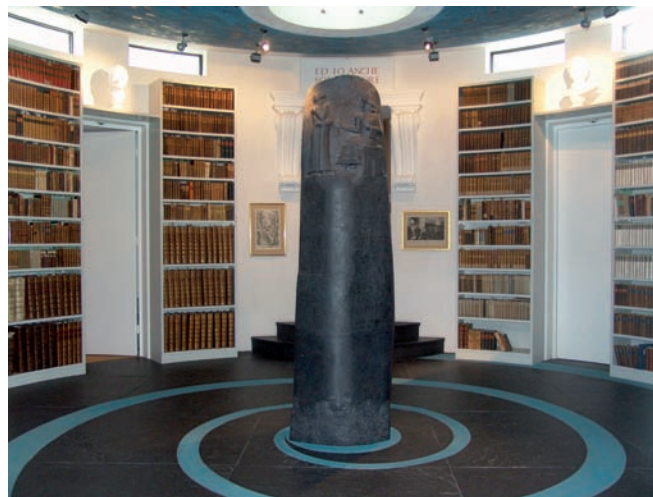
Rotunda in lower level

As a patron you can further support us by contributing to our book acquisition fund. As a renowned research library we are obliged to complement our holdings regularly and keep our collection up-to-date through the acquisition of new publications.